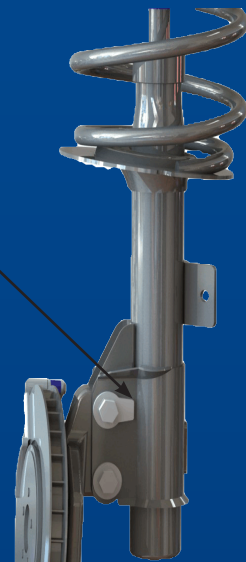
More Negative Camber